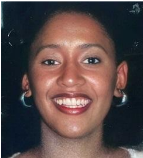
THIS PHOTO IS ENHANCED WITH AI. IT IS NOT THE ORIGINAL.

Missing Since: August 15, 1991 Missing From: Milwaukee, Milwaukee County Age: 23 years old DOB: 18 Jul 1968 Height and Weight: 5'6, 120 pounds Clothing: white shirt, black jeans and black shoes. Race: Black Sex: Female Hair: Black Eyes: Brown Exclusions: 3