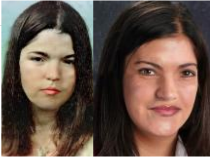
Original and age enhanced.