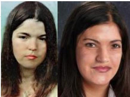
Original and age enhanced.